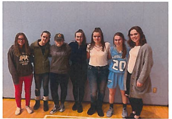
Junior High basketball players enjoyed partaking in a home game at the college.