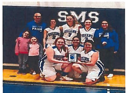
Queens place 3rd at St. Mary's