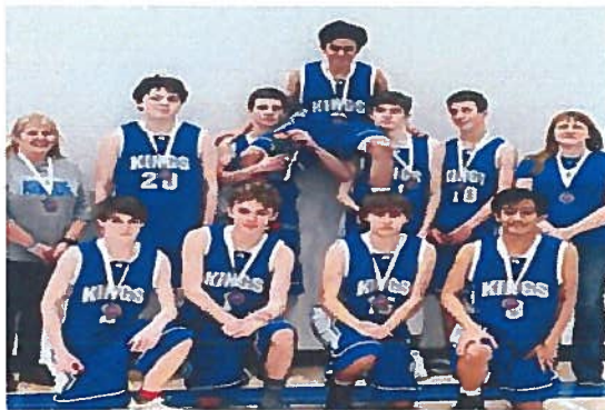
Kings place 3rd at Stirling