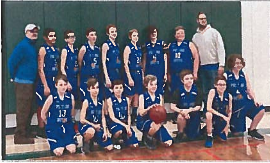
Mini Kings place 3rd in League Finals