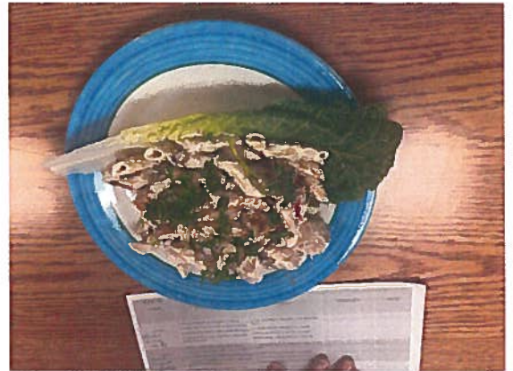
Chicken Pasta Salad Chefs: Austin, Shelby & Echoe